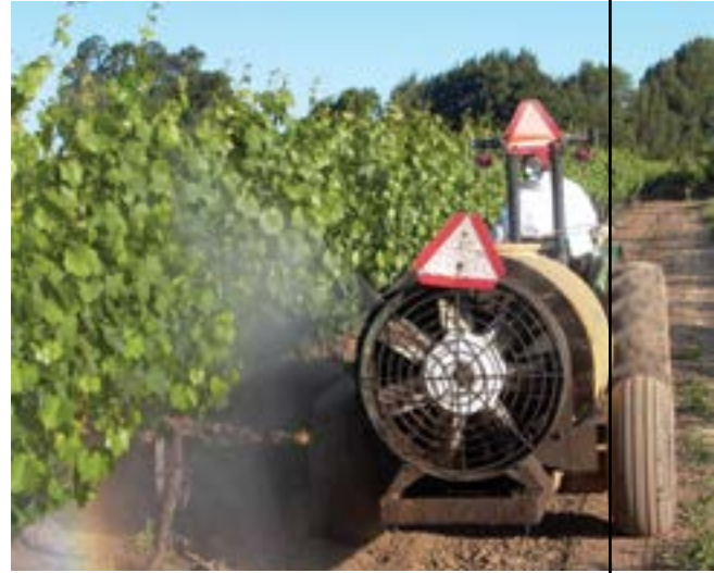
Although some pesticide may move off target in any application, applicators can and must prevent harmful drift.

Because pesticides can drift, applicators are legally required to take all possible measures to make sure that any off-site