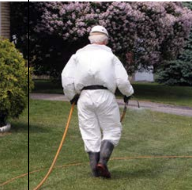
Drift can occur from residential and household pesticide applications, too. It can even happen indoors.

Because some drift can occur with any application (and may be in amounts too small to affect people or property), the laws focus on preventing substantial drift.