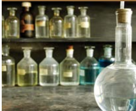
Pesticides typically contain several ingredients, any one of which may produce a sickening odor.

A breakdown product is the result of a chemical breaking apart into other chemicals. Some kinds of pesticides break down when exposed to sun or rain, or to bacteria found in soil. The breakdown is a natural process that may produce a compound that is more or less toxic than the original chemical. Many common pesticide breakdown products contain sulfur, which has a particularly bad smell.