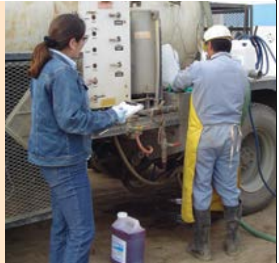
To investigate complaints, staff from the County Agricultural Commissioner's office will gather evidence to find out if pesticide laws were broken.

After the Agricultural Commissioner's staff complete their investigation, they prepare a report describing what occurred. If they found violations, they can also assess fines and other penalties. Agricultural Commissioners send their reports to DPR where scientists look for illness trends and potential problem areas. Scientists at DPR and the U.S. Environmental Protection Agency also rely on the information to improve use practices and safety information on pesticide labels.