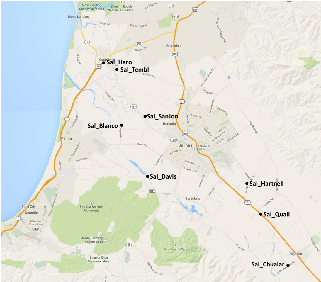
Figure 2. Monitoring sites in Salinas River and Tembladero Slough in Monterey County.