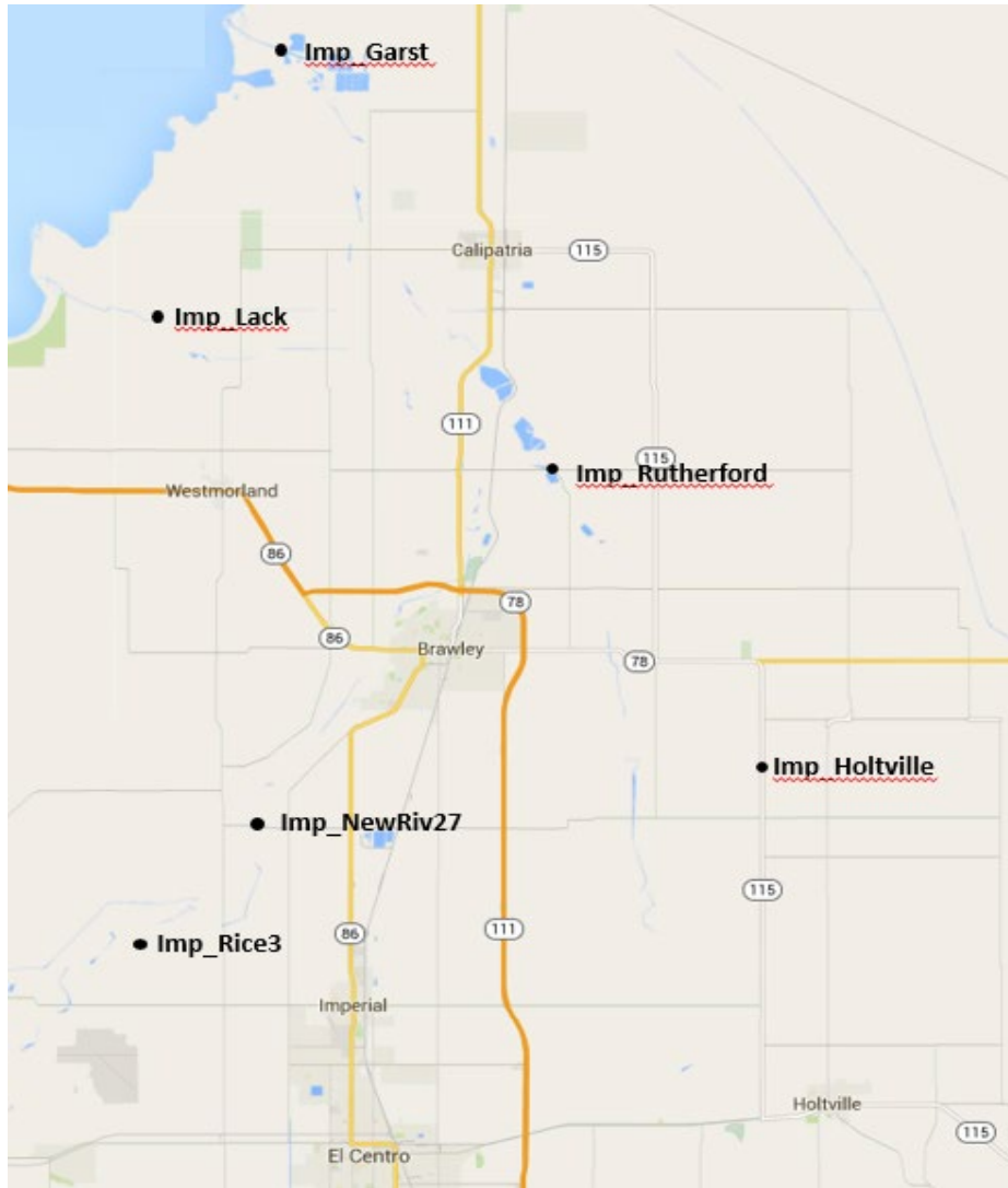
Figure 1. Monitoring sites in Alamo River and New River in Imperial County.