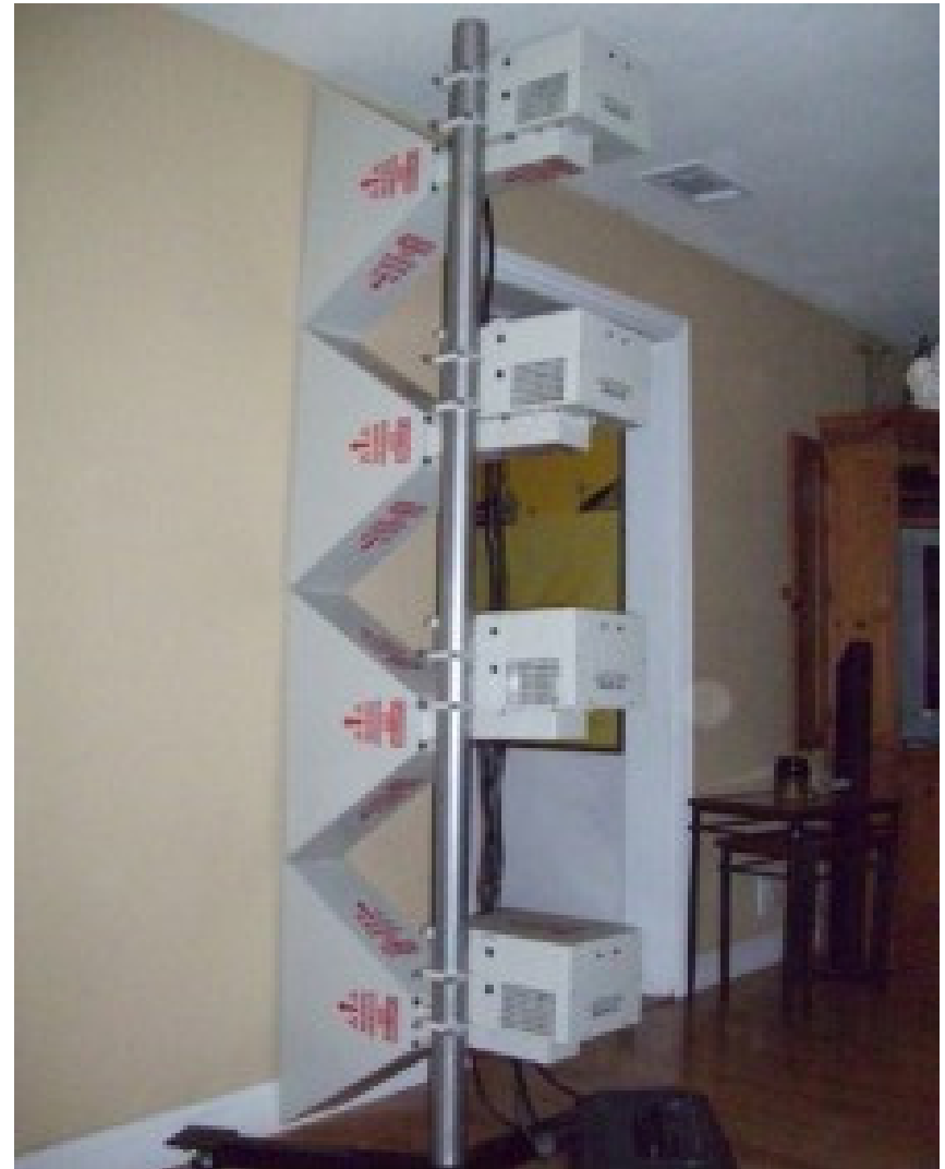
The Zapper DPR reg'd 2-9-11