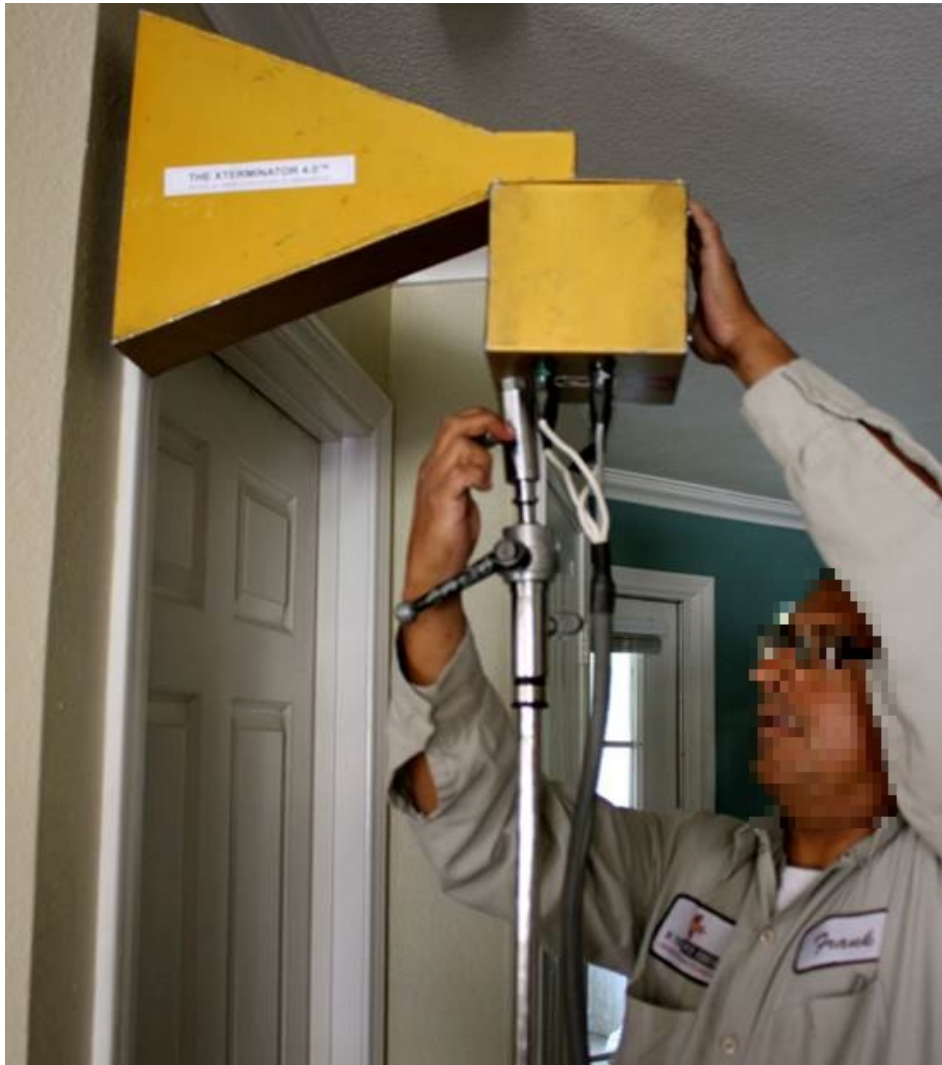
The Exterminator 4.0 DPR reg'd 11-13-12