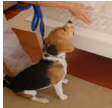
Bed Bug Sniffing Dog