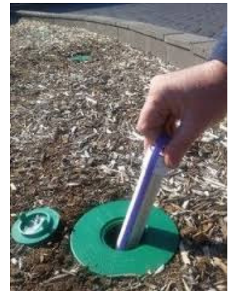
Other: Termite Bait Station