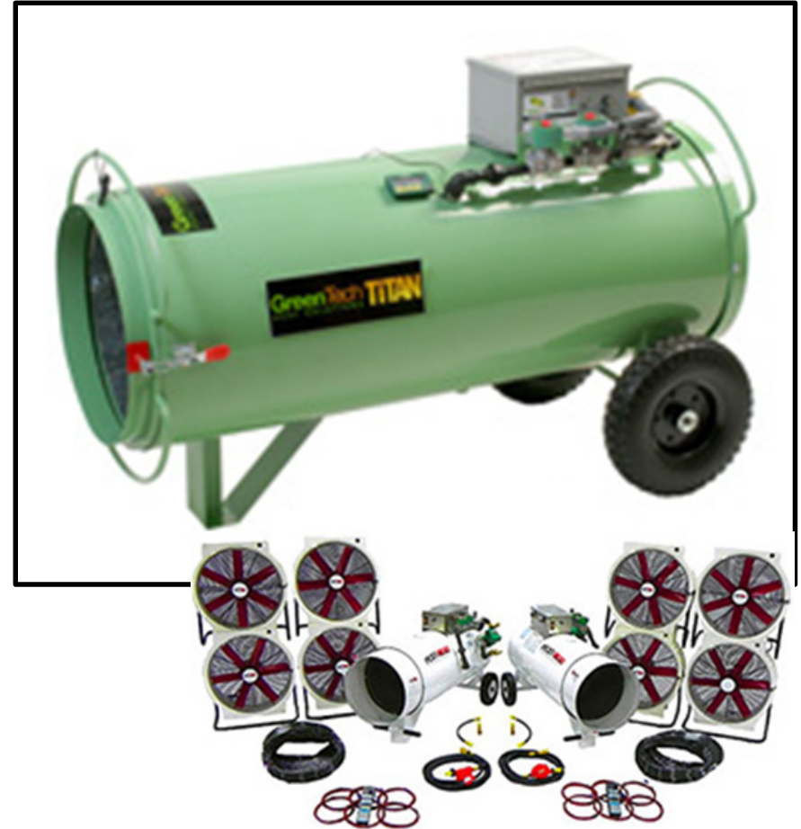
Safe Heat Model 500 DPR reg'd 4/27/10