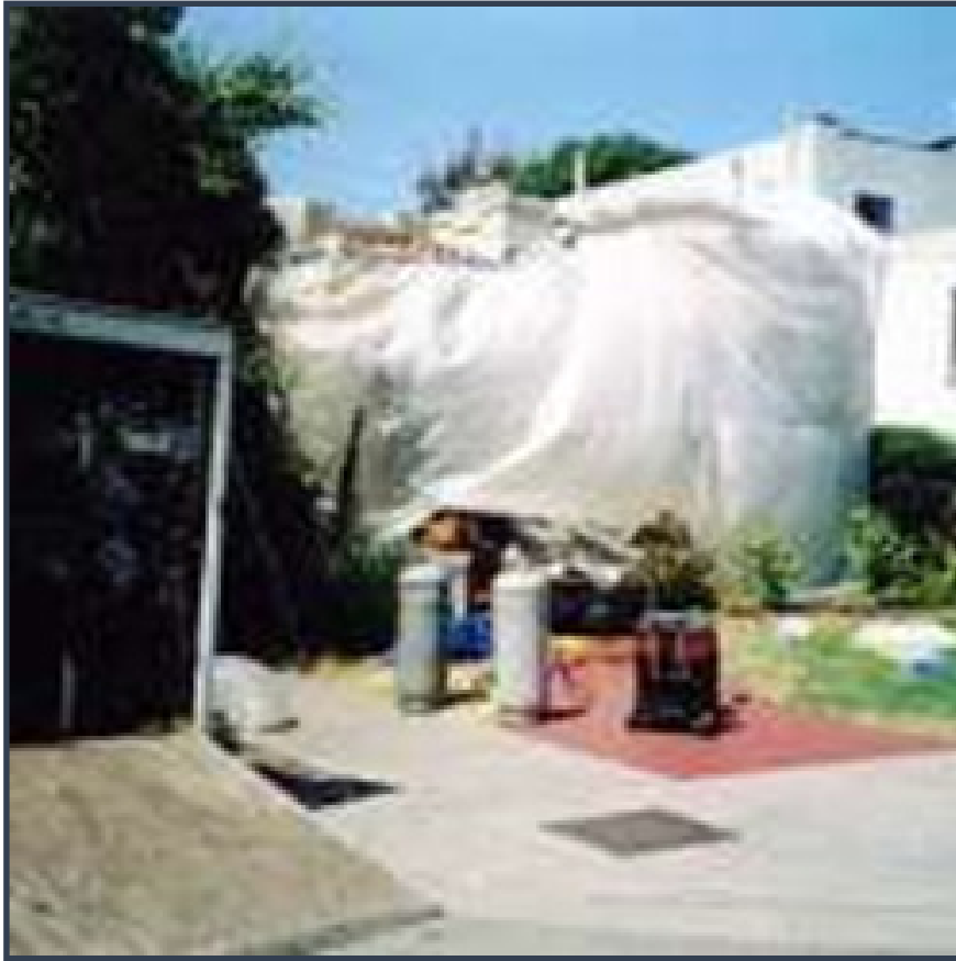
Dewey Heat DPR reg'd 7/20/10