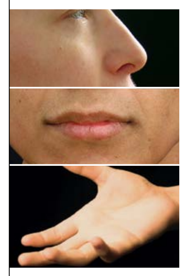
Humans can be exposed to pesticides by breathing it, getting it into their mouth, or absorbing it through the skin.

can cause great harm, but almost any substance can cause harm in large enough doses. That's why, when we consider risk, we consider both the toxicity and your exposure to it (how, how much, how long).