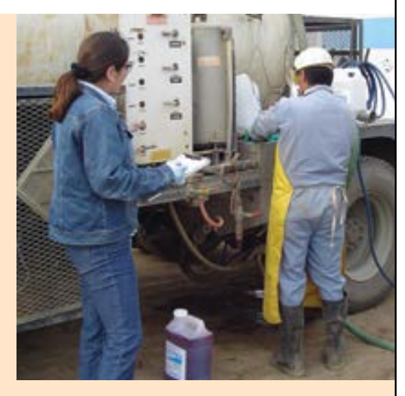
To investigate complaints, staff from the County Agricultural Commissioner's office will gather evidence to find out if pesticide laws were broken.

After the Agricultural Commissioner's staff complete their investigation, they prepare a report describing what occurred. If they found violations, they can also assess fines and other penalties. Agricultural Commissioners send their reports to DPR where scientists look for illness trends and potential problem areas. Scientists at DPR and the U.S. Environmental Protection Agency also rely on the information to improve use practices and safety information on pesticide labels.