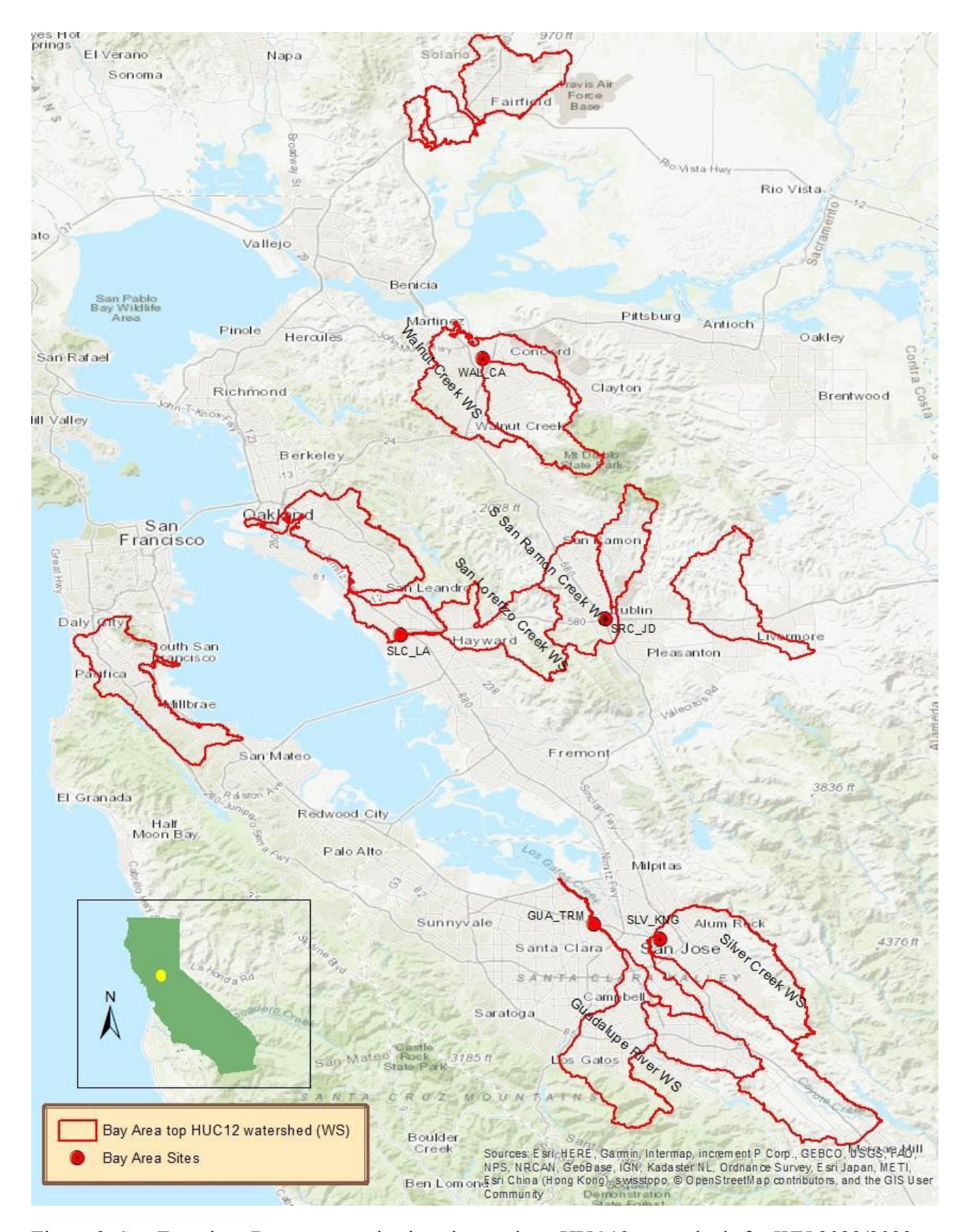
Figure 2. San Francisco Bay area monitoring sites and top HUC12 watersheds for WY 2022/2023.