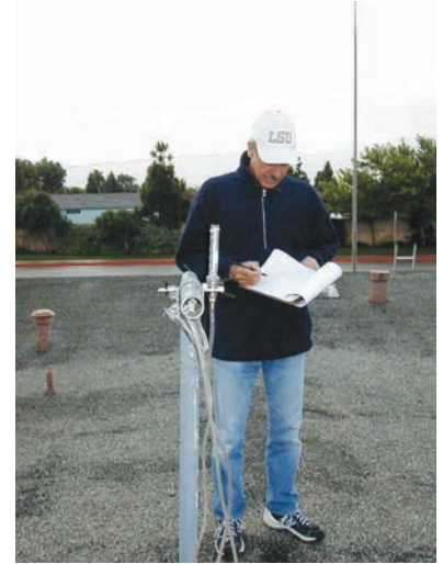
In response to community public health concerns, DPR conducted air studies in the 1990s in Lompoc, Santa Barbara County.

In 1993, DPR began looking into health concerns of residents in the Santa Barbara County community of Lompoc and the surrounding valley (population roughly 43,500). Residents were concerned that pesticide applications in the vegetable- and flower-growing region were causing health problems. Working with the CAC, DPR staff held several community meetings to discuss health symptoms, pesticide exposure, exposure to dust and pollen, effectiveness of regulatory controls in protecting citizens from pesticide exposure, quantities of pesticides used in the area, and available alternatives to pesticides. To allay community concerns, the CAC had placed several restrictions on pesticide applications in the area, including buffer zones around schools and homes. In 1995, DPR staff completed a report on pest management practices in the Lompoc Valley with an emphasis on crops grown, their associated pests and pest control practices, including use of pesticides and alternative pest control methods. In 1998, DPR completed an analysis of weather patterns in Lompoc. This analysis compared weather in Lompoc to 11 other coastal areas in California. The analysis indicated that pesticide air concentrations could be higher than the comparison areas because of differences in weather during some periods of the year.