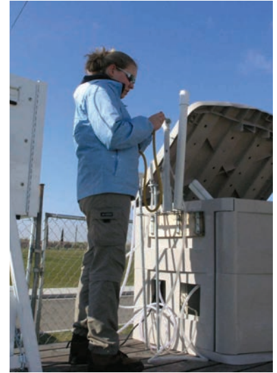
The air monitoring station in Parlier.

In 2016, DPR reassessed its monitoring locations and other aspects of its Air Monitoring Network. DPR selected eight communities for monitoring, including