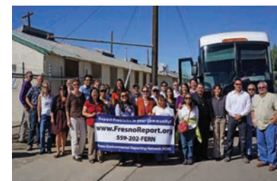
As part of its environmental justice efforts, DPR works with community groups like the Fresno Environmental Reporting Network to monitor and help solve issues that threaten the health of community members.