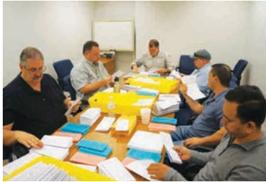
Mill payment reminders being prepared in 2015.

to a maximum of 17.5 mills through December 2002 when, without subsequent legislation, it would have reverted to 9 mills. The Legislature set the 17.5-mill maximum artificially low to allow the department to spend down a large reserve in the DPR Fund. The bill increased the assessment that funded CDFA's pesticide consultation to three-quarters of a mill and changed it to apply only on agricultural and dual-use products. The law requires CDFA to decide each year "the necessity of this additional assessment" and it may choose not to have it collected in any given year.