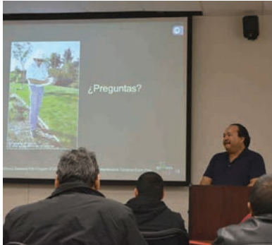
Maintenance gardener certification exam in 2016.

supervision, pesticide handler safety, pesticide storage and transport, protective equipment and engineering controls, minimal exposure pesticides, and respiratory protection. The leaflets are available on DPR's website in English, Spanish and Punjabi.