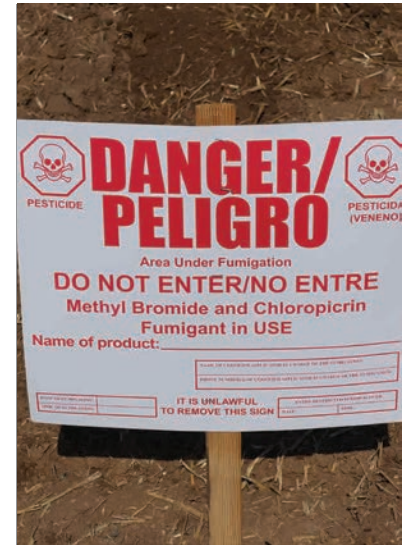
Signs posted in fields alert workers and others about pesticide applications.

DPR requires training each year of employees who handle pesticides (for example: mixers, loaders, applicators, and application equipment mechanics). Starting Jan. 2, 2017, DPR required annual training for fieldworkers which is a new requirement contained within the 2015 revision to the WPS. California regulations require that pesticide handler and fieldworker training incorporate the Pesticide Safety Information Series (PSIS) leaflets produced by the WHS Branch. PSIS leaflets are available for workers in both agricultural and nonagricultural settings. Subjects include hazard communication (worker rights), first aid, medical