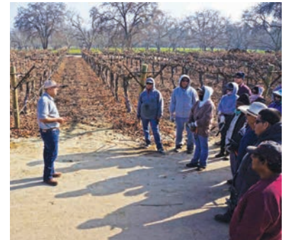
A farm labor contractor conducts worker safety training in Tulare County, 2015.