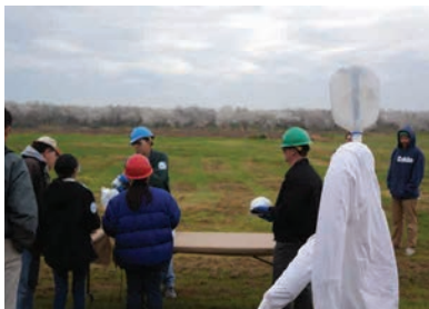
DPR scientists study the movement of pesticides in the air during a drone demonstration in Arbuckle in 2016.

increase knowledge of how workers and others are exposed to pesticides and, in doing so, improve protective measures.