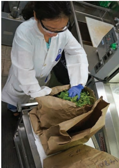
Cilantro tested for pesticide residue at the CDFA lab in Anaheim in 2015.