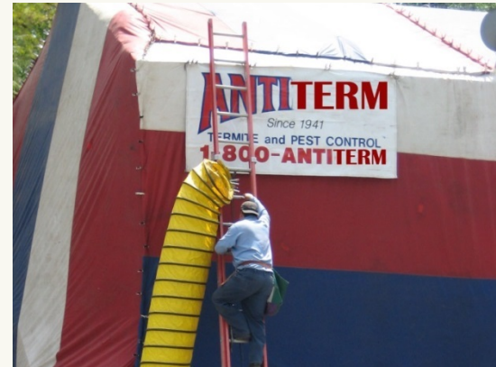
The tarp has a sign for a different company