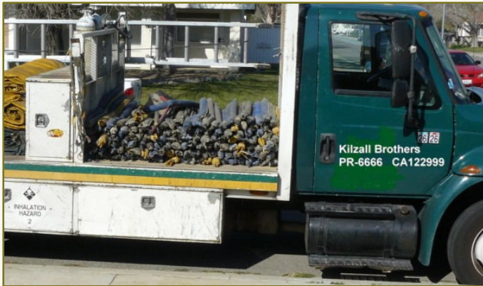
Fumigators arrived in a truck labeled with the name of the registered company

Is this registration in compliance (yes or no) ?