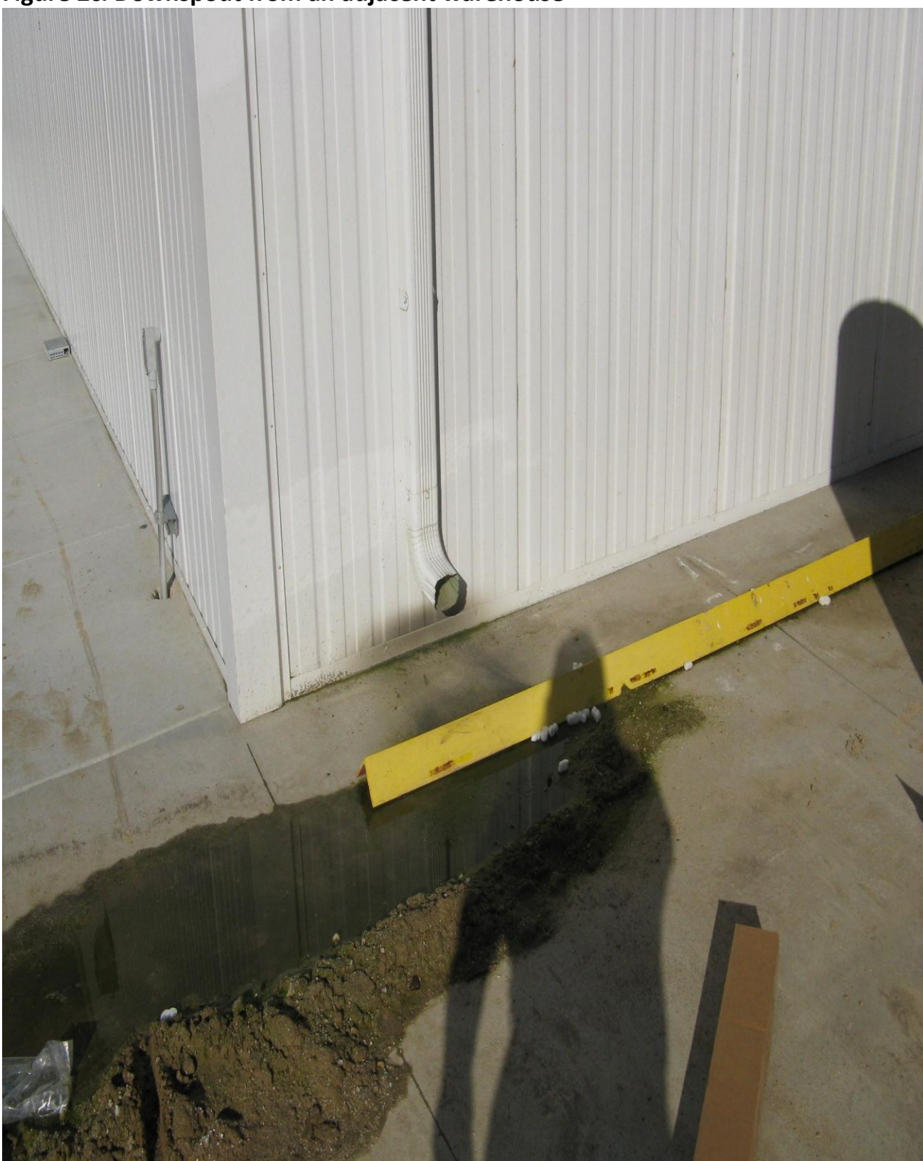
Figure 2c. Downspout from an adjacent warehouse