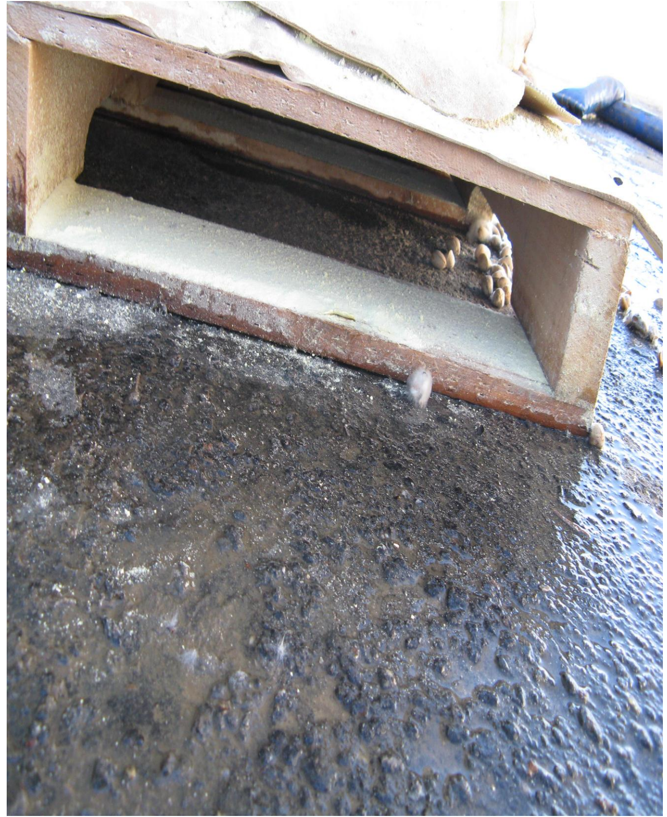
Figure 2b. Wooden pallets under the stacks of pistachio bags