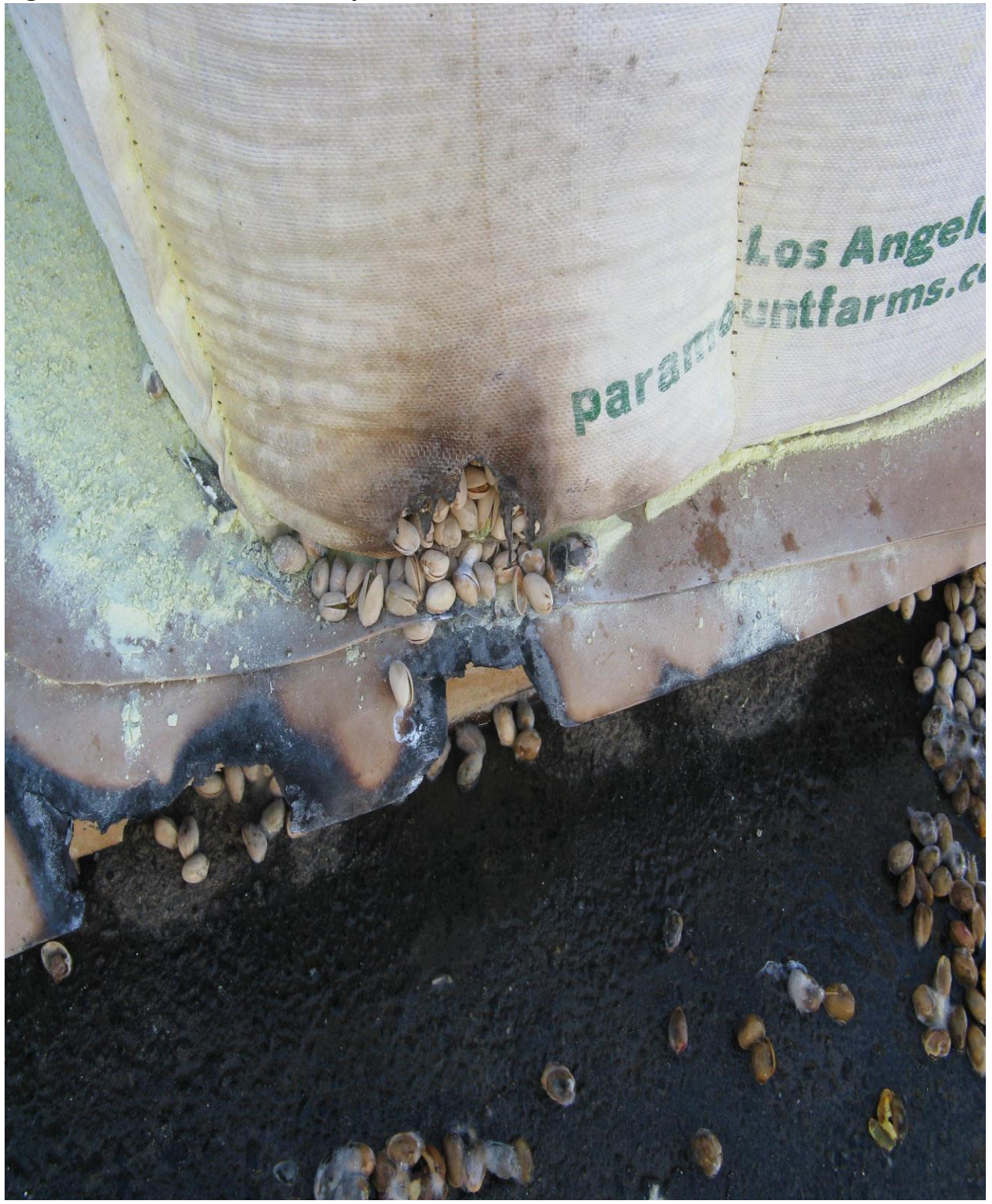
Figure 2d. Bottom of burned pistachio sacks