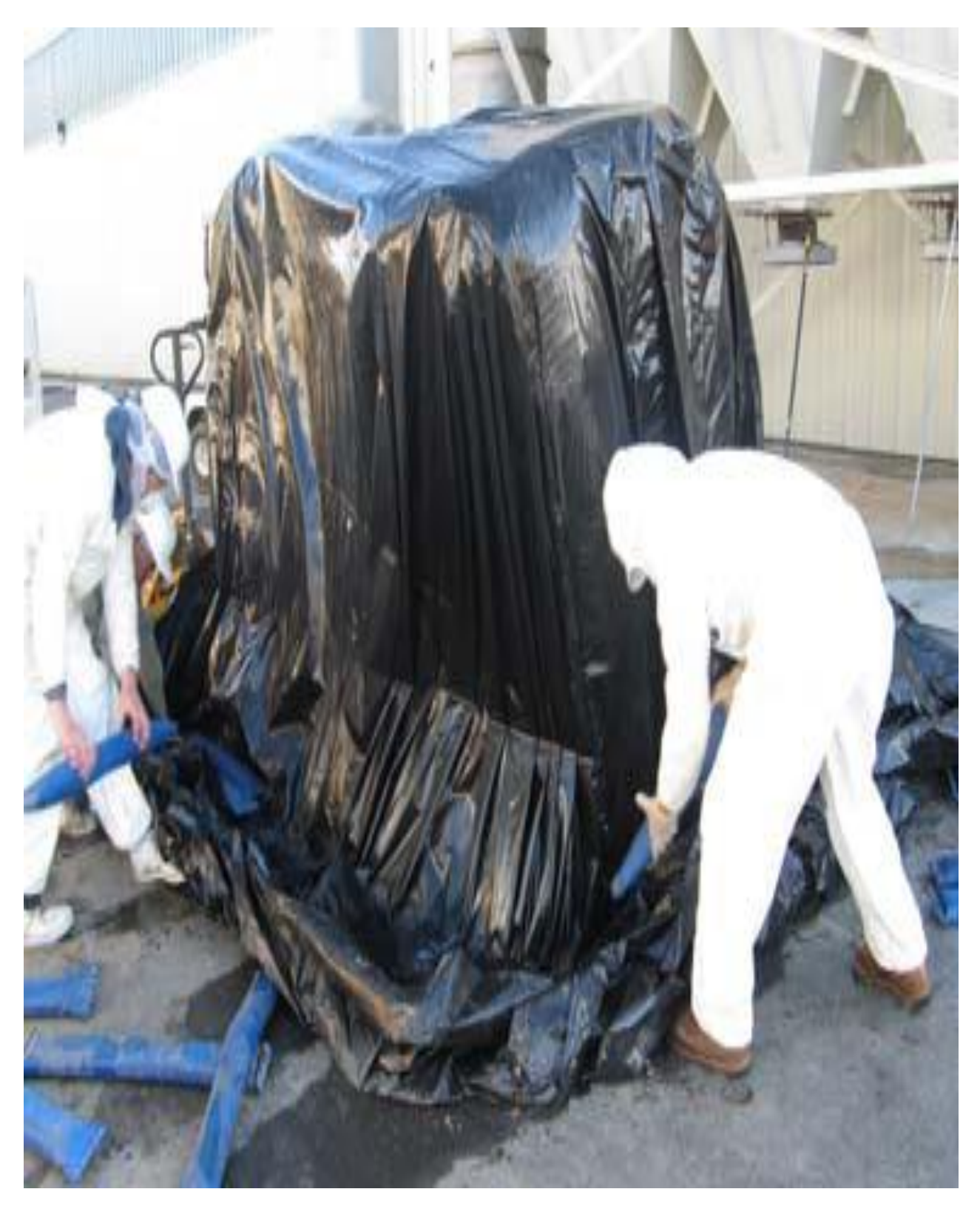
Figure 2a. Pistachio Bags covered by Black Film