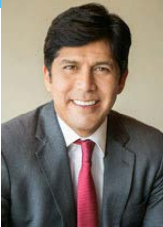
Kevin de León Senate President pro Tempore