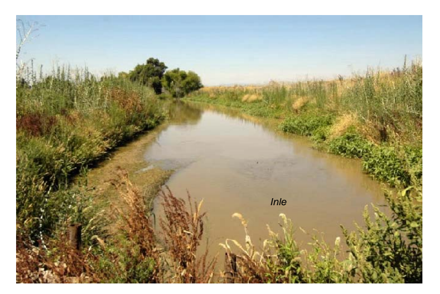
Figure 3. Inlet of wetland