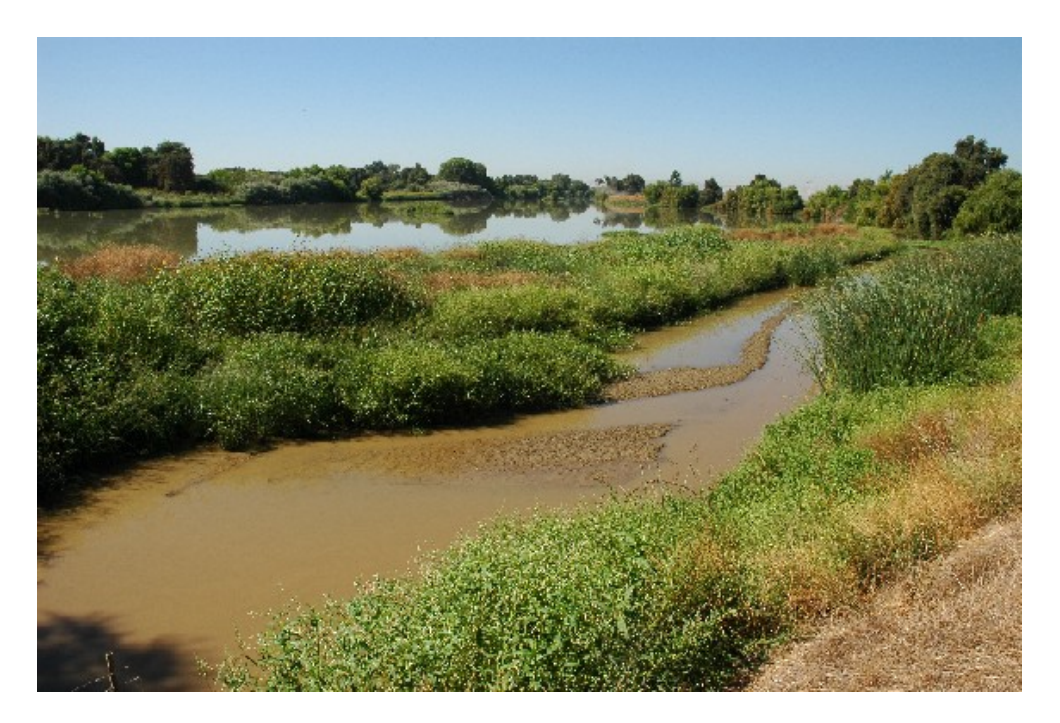
Figure 1. Wingsetter Ranch constructed wetland, Stanislaus County, California