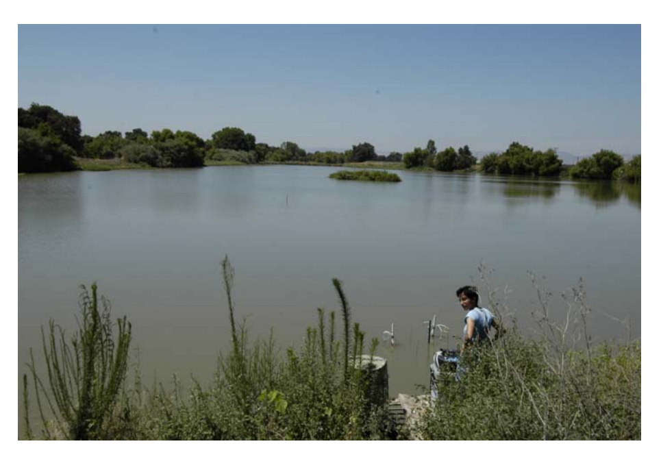
Figure 2. Outlet1 sample collection

One tracer injection was made on August 6th, 2007, ten days after monitoring for pesticides had occurred. Irrigation practices were similar to those in July when pesticide monitoring occurred. The NaBr tracer was applied and collected as follows: