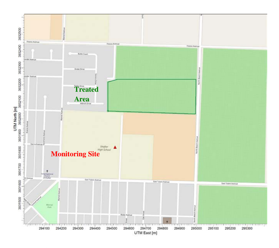
Figure 3. Diagram of modeling source and receptor