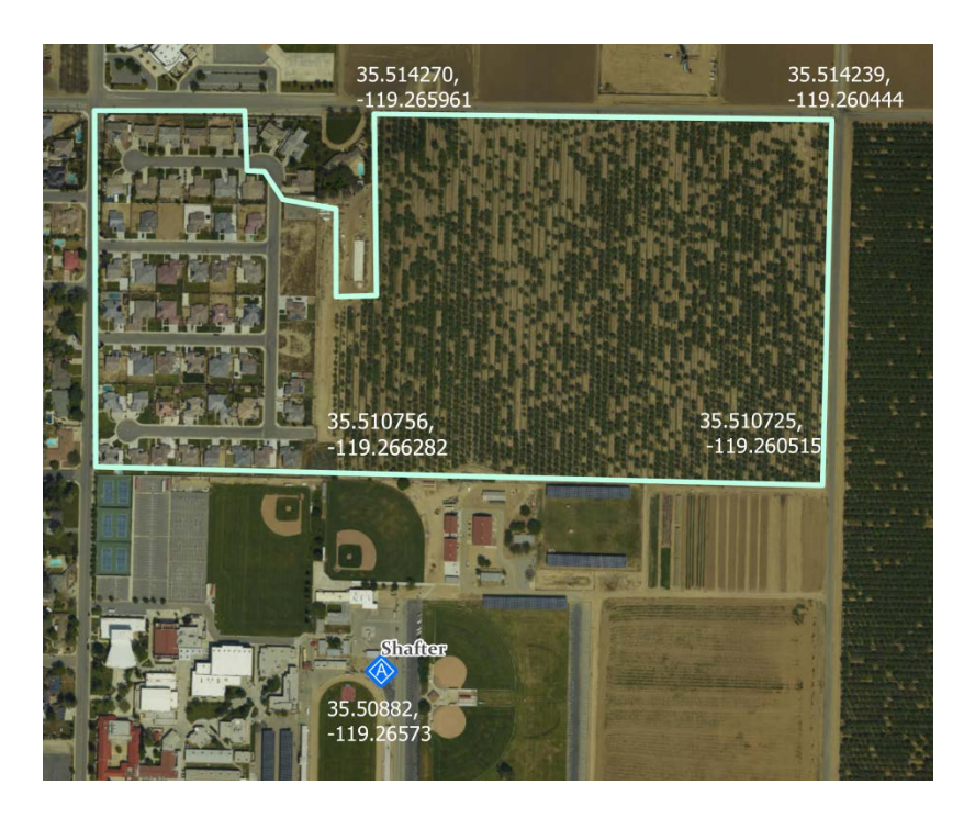
Figure 1 . Location of the monitoring site and agriculture field where the application was conducted on January 21, 2018.