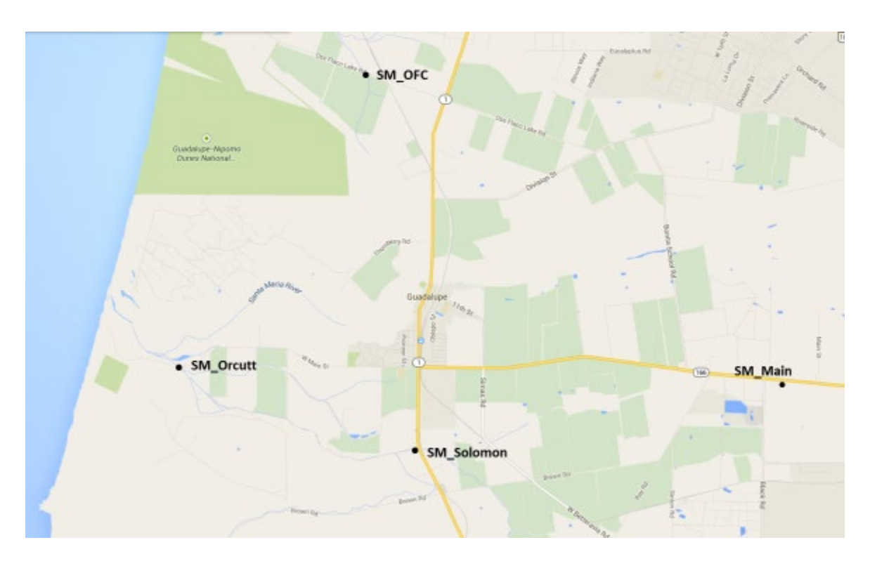
Figure 3. Monitoring Sites in Orcutt Creek and Oso Flaco Creek in San Luis Obispo and Santa Barbara Counties.