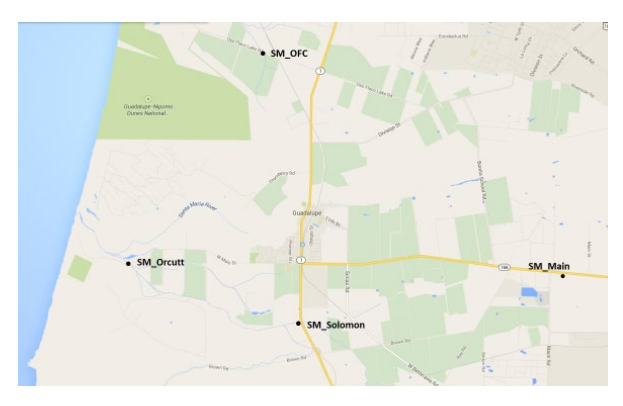
Figure 3. Monitoring sites in Orcutt Creek and Oso Flaco Creek in San Luis Obispo and Santa Barbara Counties.