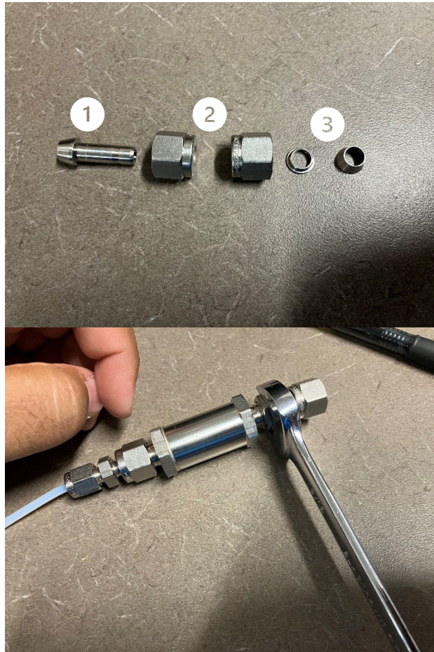
Figure 5. Swagelok® parts needed for flow controller adapter assembly.