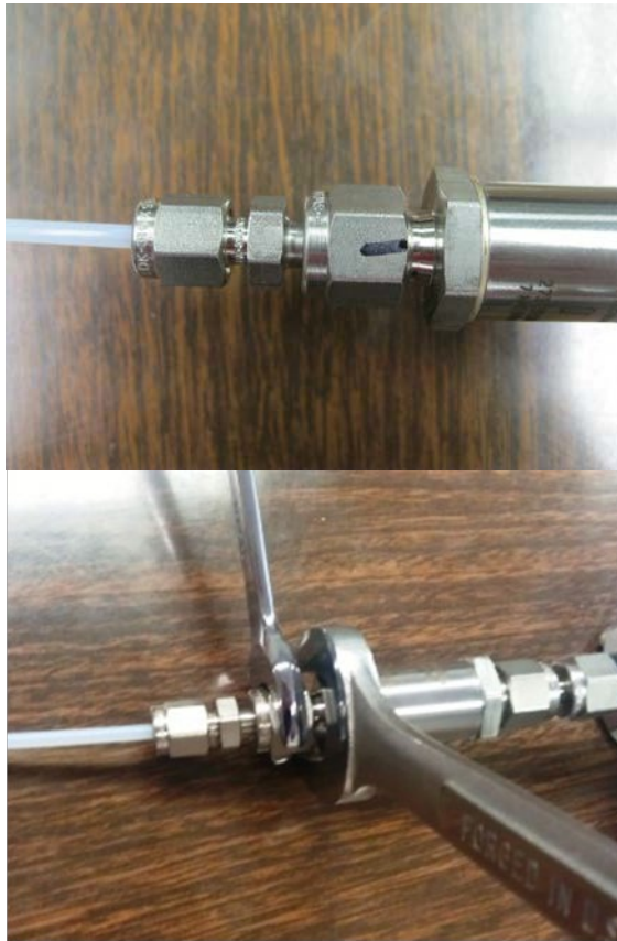
Figure 4. Wrenches are used to further tighten the connection between the adapter and inline filter.