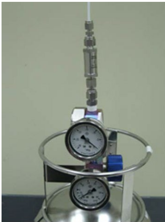
Figure 7. Mechanical regulator attached to a Summa canister.