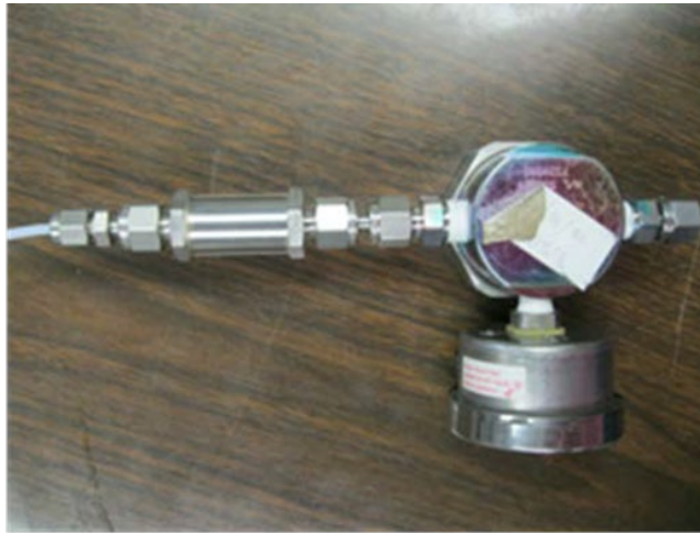
Figure 6. Inline filter attached to the flow controller. When fully assembled, this is what a usable mechanical regulator will look like.