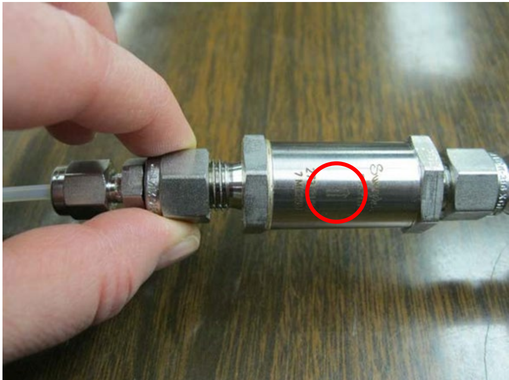
Figure 3. Picture of the 7-micron inline filter attached to the adapter that was constructed in the previous two steps.